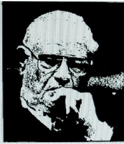
Sen. Ike Smalley